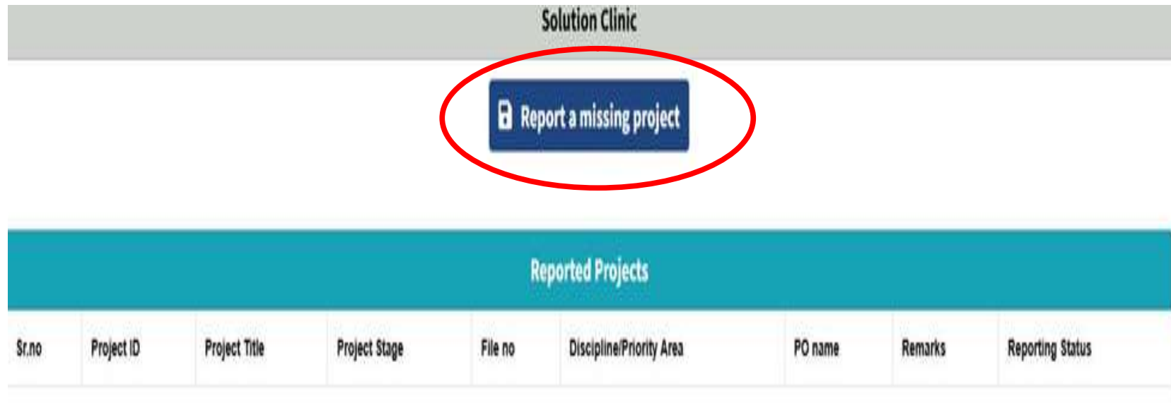
Figure 11: Click on ‘Report a missing project’ option in blue.